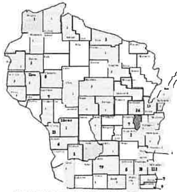
Wisconsin Certified Peer Specialists by County as of October 2017